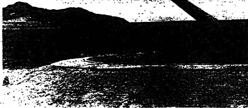
According to former Foreign Secretary George Brown, Britain lacked 'the guts' to send a naval task force through the Gulf of Akaba, which was dominated by Egyptian shore batteries at Ras Nasrani (foreground) and on the island of Tiran (in the background).

Denis Healey, the Defence Secretary, had evidently supported the expedition in earlier private conversations with Lord George Brown, now came out against it on strategic grounds. He had taken advice from the naval planners. "We couldn't send large ships ashore. They would be sitting ducks in these narrow waters to shore batteries, torpedoes and aircraft. A shipborne military operation in well-guarded narrow waters is nonsense. I can see the logic of the Foreign Sec-